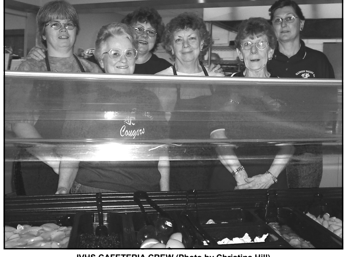
IVHS CAFETERIA CREW