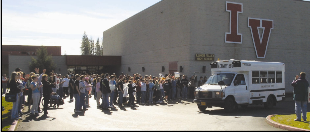
Illinois Valley High School wrestlers get enthusiastic student body send-off as they head to state competition Wednesday, Feb. 16.