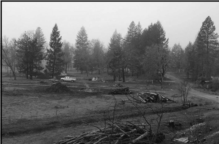
There's lots of residential construction activity in the city of Cave Junction. (Clockwise from bottom left) Daisy Hill Road work, Echo Park on Schumacher