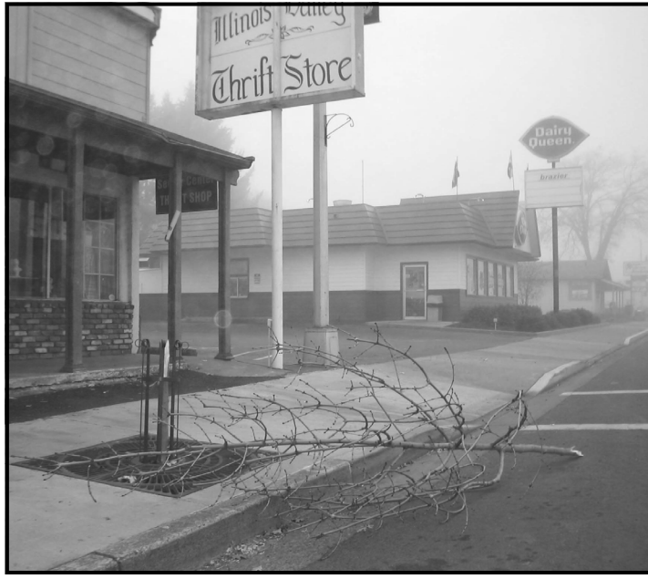
DOWNTOWN VANDALISM - Apparently the village idiot was on the loose some time late Tuesday, Nov. 23 or early Wednesday, Nov. 24. A person or persons unknown broke off another tree in Downtown Cave Junction. The trees are part of the city's efforts to make the town more attractive.