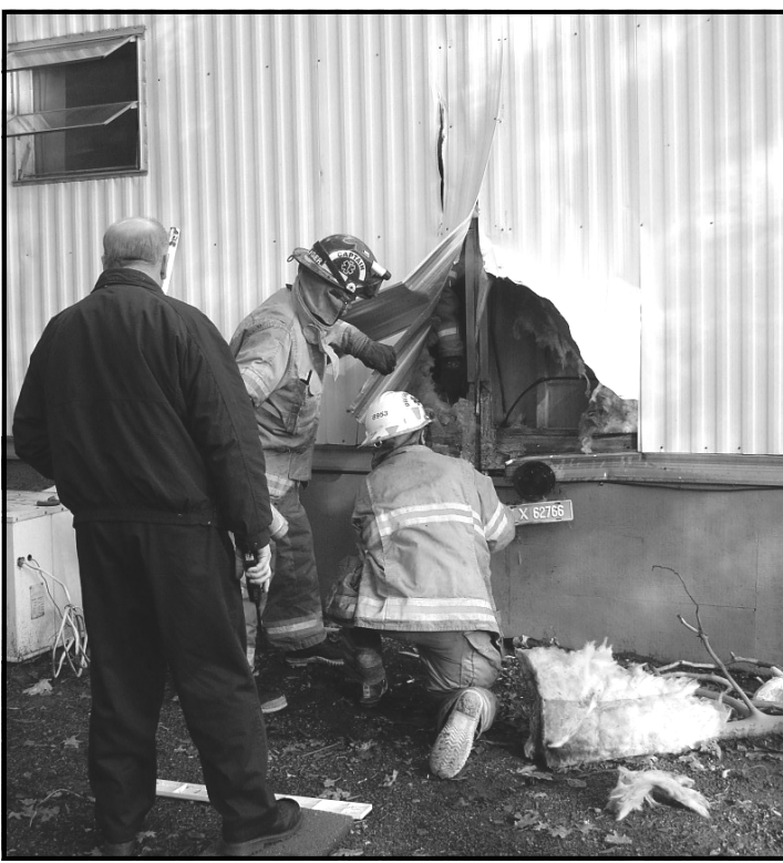
WALL FIRE - Illinois Valley firefighters responded to a smoke-filled mobile home at 701 Caves Hwy. behind fire station 1 Monday afternoon, Nov. 29. They found that an apparently faulty electrical outlet had caused a fire inside a wall. No injuries were reported.

LAST WORDS - Tap into people's dignity, and they will do anything for you. Ignore it, and they won't lift a finger. (Thomas Friedman)