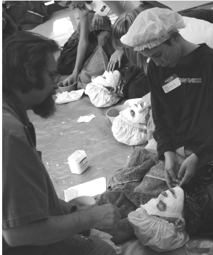
Learning Through Arts Committee members worked with Lorna Byrne Middle School seventh-graders to make Day of the Dead masks and other items for their studies and observance.