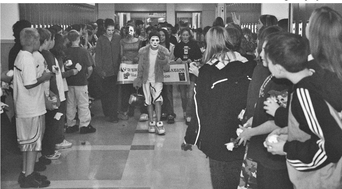
Students at Lorna Byrne Middle School studied the Mexican celebration of Day of the Dead; culminating with a procession (top and bottom photos) through the main downstairs hallway. Seventh-grade students made numerous masks (center photo) and other items for the observance, which they shared with their fellow students.

BLM issued a reminder that 911 is to be used only to report emergencies; not to seek information.