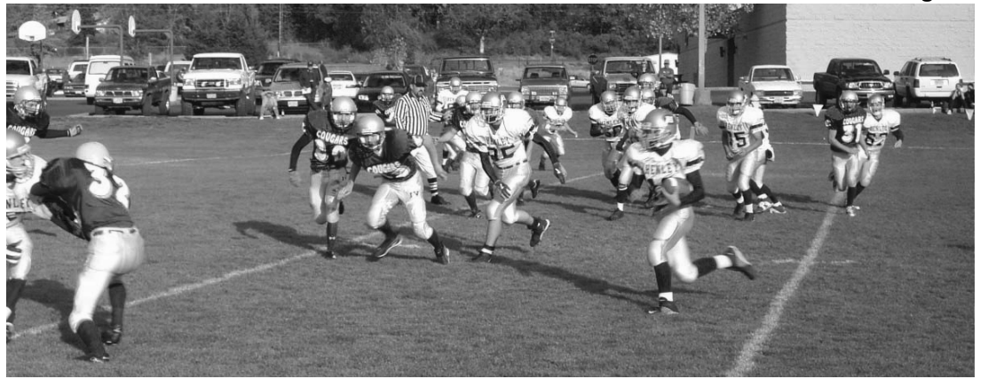
JV TEAM SACKED - Illinois Valley's JV football team lost to Henley in Cave Junction on Thursday, Oct. 21. The Cougars were defeated 36-6 by the Hornets.

Assessor office hours are 8 a.m. to 5 p.m.; tax collector office hours are 9 a.m. to 5 p.m. Mondays through Fridays.