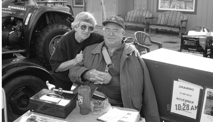
HARVEST MARKET - Illinois Valley Family Coalition held its first Harvest Market Saturday, Oct. 9 on the coalition parking lot on E. River Street. Arts and crafts, plus plants were featured, and there was entertainment.