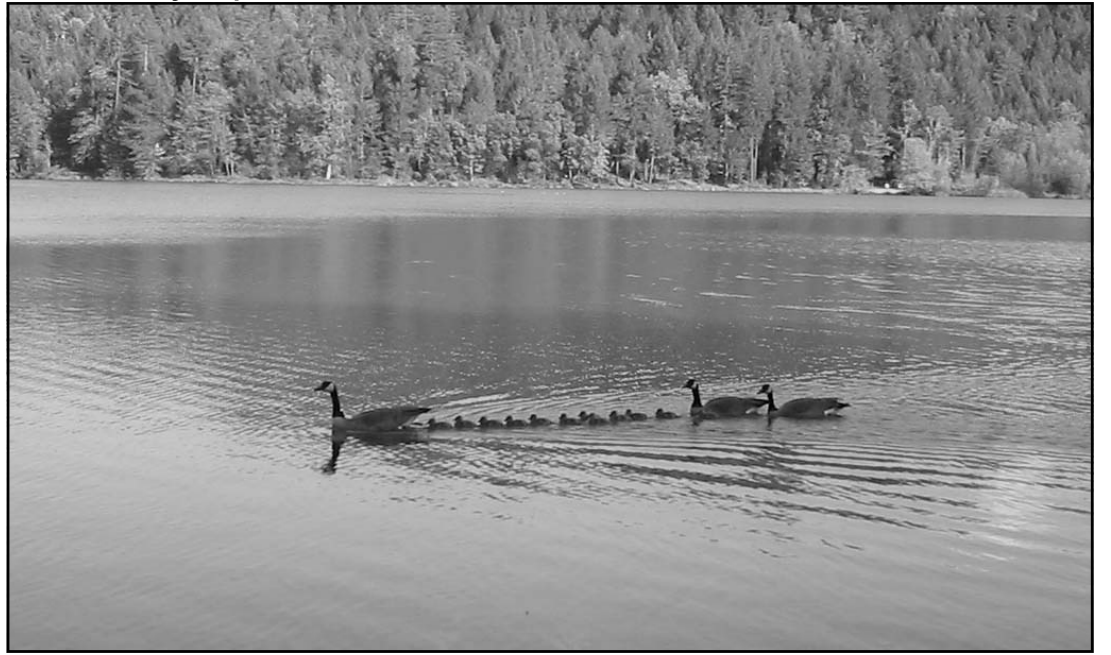
Life goes on as usual at Lake Selmac, although a toxic algal bloom is causing problems, making the water unfit for human consumption.

Get 'The News' every week. See page 8. Do it now!