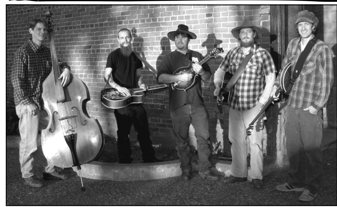
'The Lazybones Bluegrass Band' from Arcata will perform among others July 31