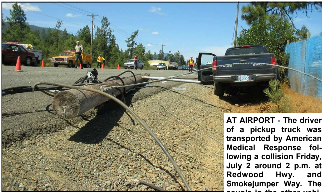
AT AIRPORT - The driver of a pickup truck was transported by American Medical Response following a collision Friday, July 2 around 2 p.m. at Redwood Hwy. and Smokejumper Way. The couple in the other vehicle, a Volvo, were reported uninjured, although the hood and a fender were torn off. A utility pole was knocked down in the crash, resulting in a temporary loss of 911 calling capability for O'Brien. The crash was investigated by OSP Senior Trooper Randy Hoxsie.