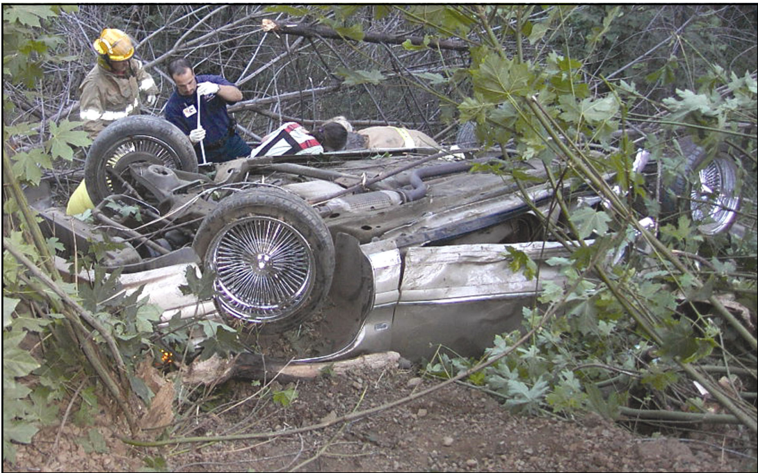
Illinois Valley firefighters and American Medical Response medics remove injured teen-agers from a car approximately 6 miles westerly of Selma after the car in which they were riding went out of control and over an embankment.

Copies of the alumni newsletter listing activities and locations are available at Valley Bookkeeping, the "Illinois Valley News" office and other locations.