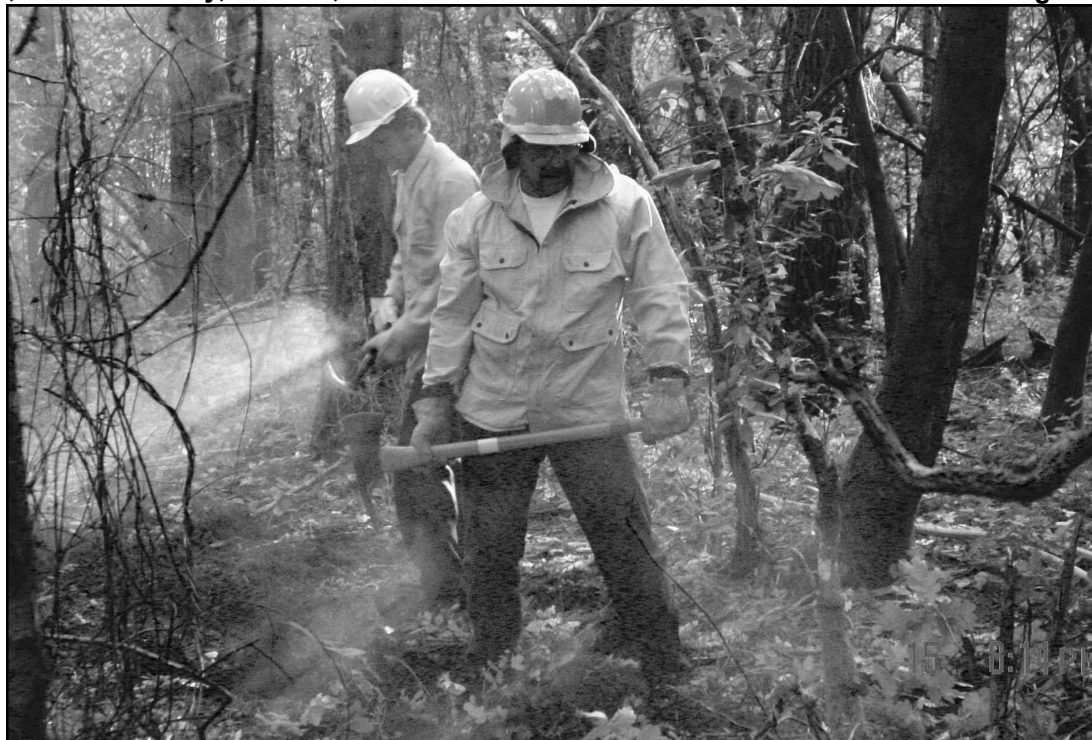
A fire of unknown origin burned approximately 1/10th of an acre of vegetation on the west side of Hwy. 199 between Z Coffee and Illinois Valley Golf Course on Tuesday evening, June 15.