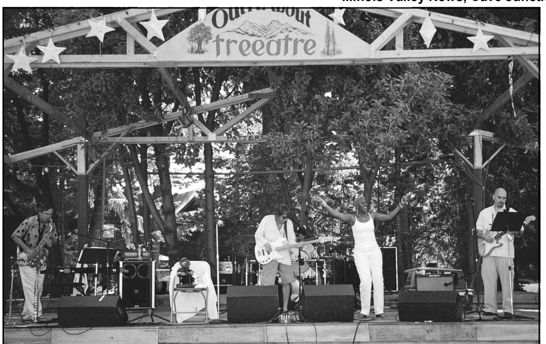
A REAL 'TREET' - With the likes of 'Israel Vibration' and 'Rock Robin & The Toasters,' the third annual Solfest at Out 'N' About Treesort in Takilma was held on Saturday and Sunday, June 19-20. Vendors and a full-stage line up encouraged people to camp and enjoy the weekend. The treehouse resort is booking dates months in advance. For information contact www.treehouses.com.