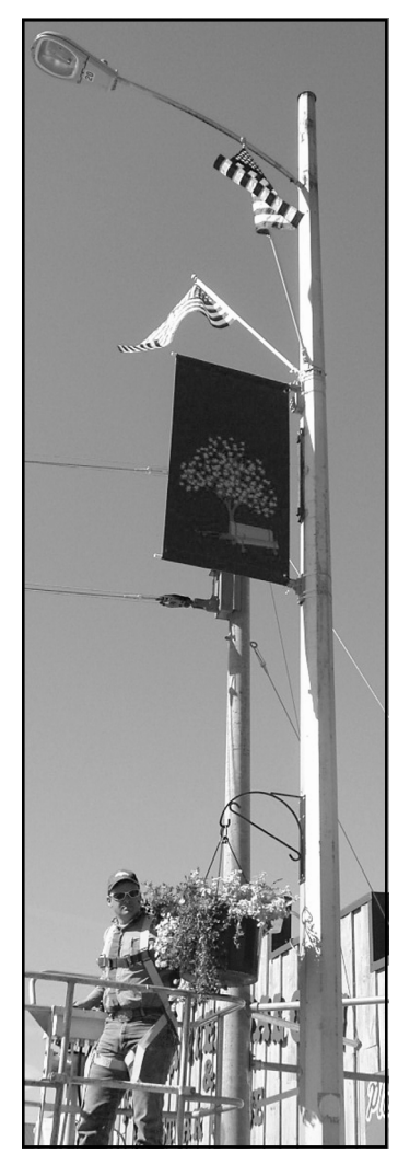
'MAIN' DISPLAY - City of Cave Junction employees placed U.S. flags and color flower baskets along Redwood Hwy., the city's main street, last week for Memorial Day. The plants were ob-Siskiyou tained from Greenhouses.