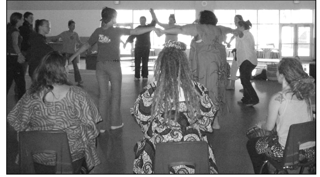
'STARS IN AFRICA' - Members of The Shining Stars conducted a special African program for seventh-grade students at Lorna Byrne Middle School in conjunction with the students study of Africa. Besides teaching a traditional dance, The Shining Stars also demonstrated animal scratchboard drawing, and making Adinka cloth and stringing African beads.

For more information on America's High School Idol contest, log onto www.americashighschooli dol.com. Click on the national's link and scroll