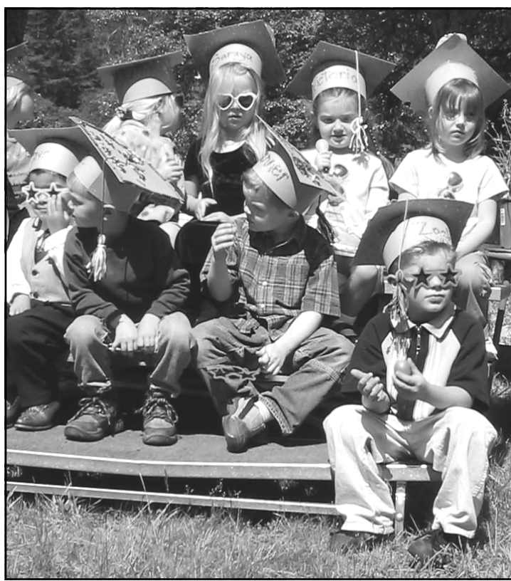
LITTLE GRADS - The Head Start program in Cave Junction conducted an outdoor graduation ceremony on Friday, May 21 at 'Forks' State Park. The weather was warm, but not uncomfortable. The young grads wore special mortarboards, and after the official ceremony were provided snacks. Numerous parents, relatives and friends attended the event. Head Start parents and staff said they appreciate the many Illinois Valley businesses that helped support the overall program this year.