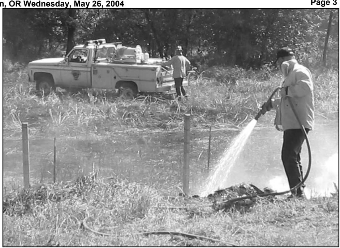
CITIZEN SAFETY URGED - During the past several days, Illinois Valley firefighters have responded to a number of escaped debris burns including this one on Westside Road. The fire district urges residents to be fire safe. Phone 592-2121 or 592-2225 for information or fire safety advice.