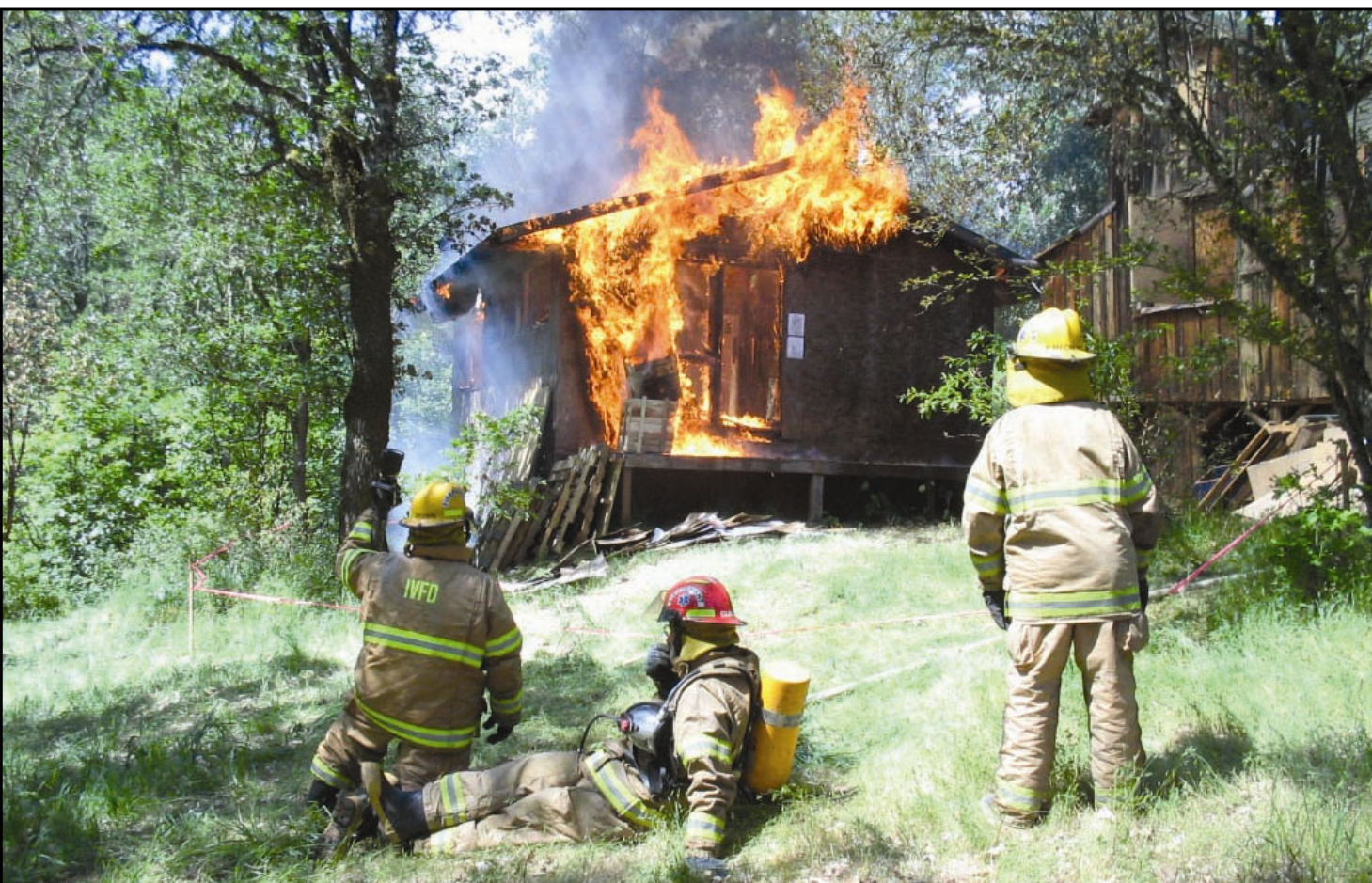
PRACTICE (FIRE) MAKES PERFECT - Illinois Valley Fire District volunteer firefighters participated in a successful live fire exercise off S. Old Stage Road on Sat-

For more information on fire prevention safety, contact Illinois Valley Fire District at 592-2225; or Oregon Dept. of Forestry, (541) 474-3152.