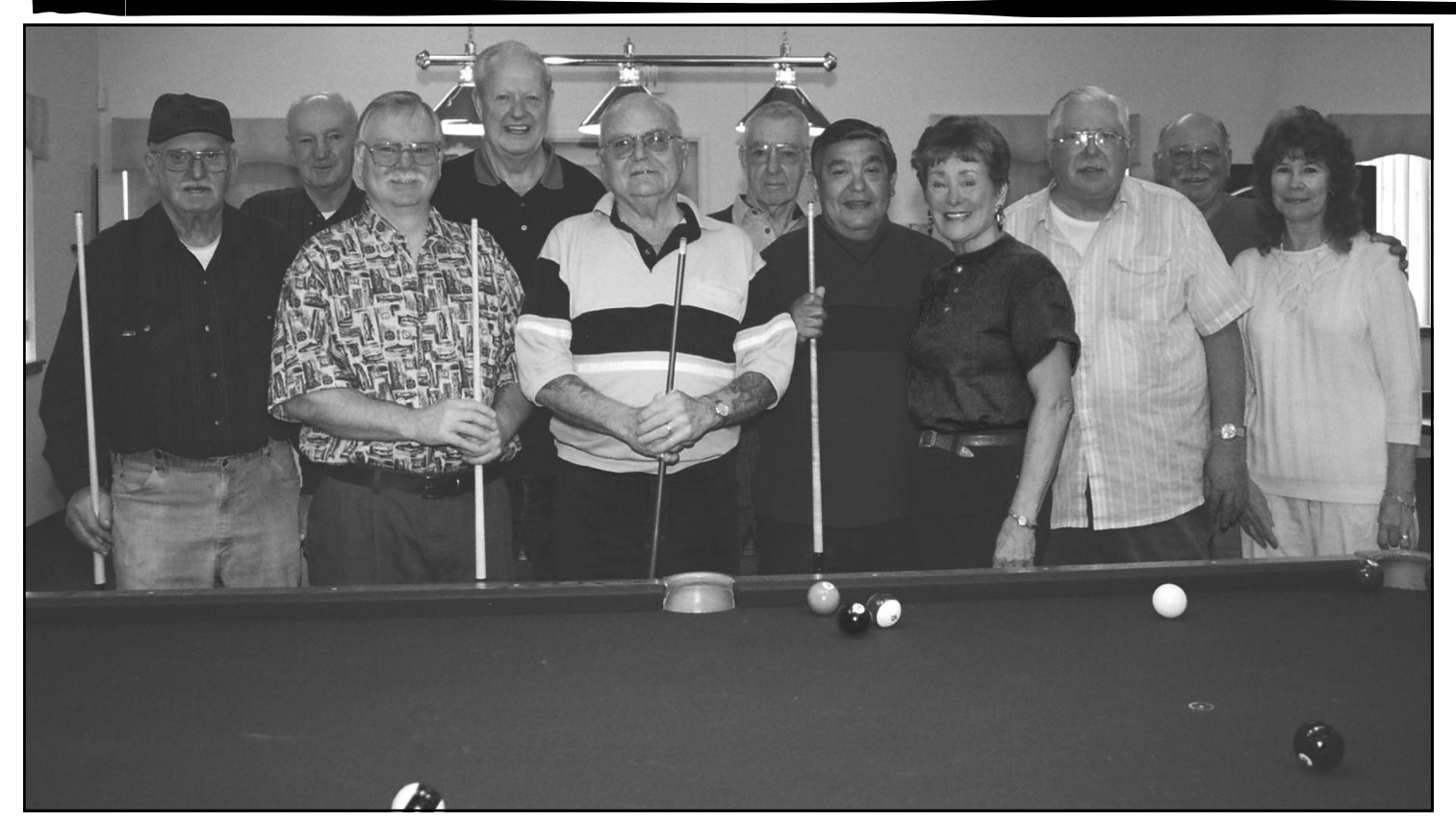
SENIORS RACK 'EM UP - Members and guests at Illinois Valley Senior Center at 520 E. River St. in Cave Junction can usually find a program or activity under