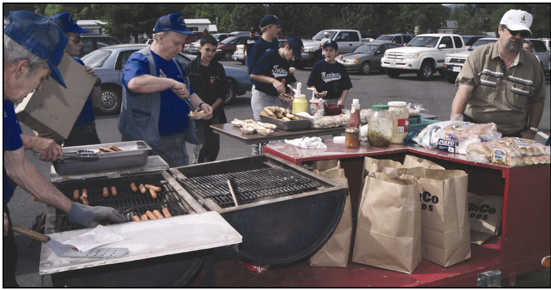
HOT DOG! - Kerby Belt Masonic Lodge members provided and served free hot dogs on Saturday, May 1 to players and others on opening day of Illinois Valley Little League. The Masons have provided the frankfurters for Little League's opening day ceremonies for several years as part of their community service. The wieners were much appreciated, especially by the players. (Related photos on page 24)