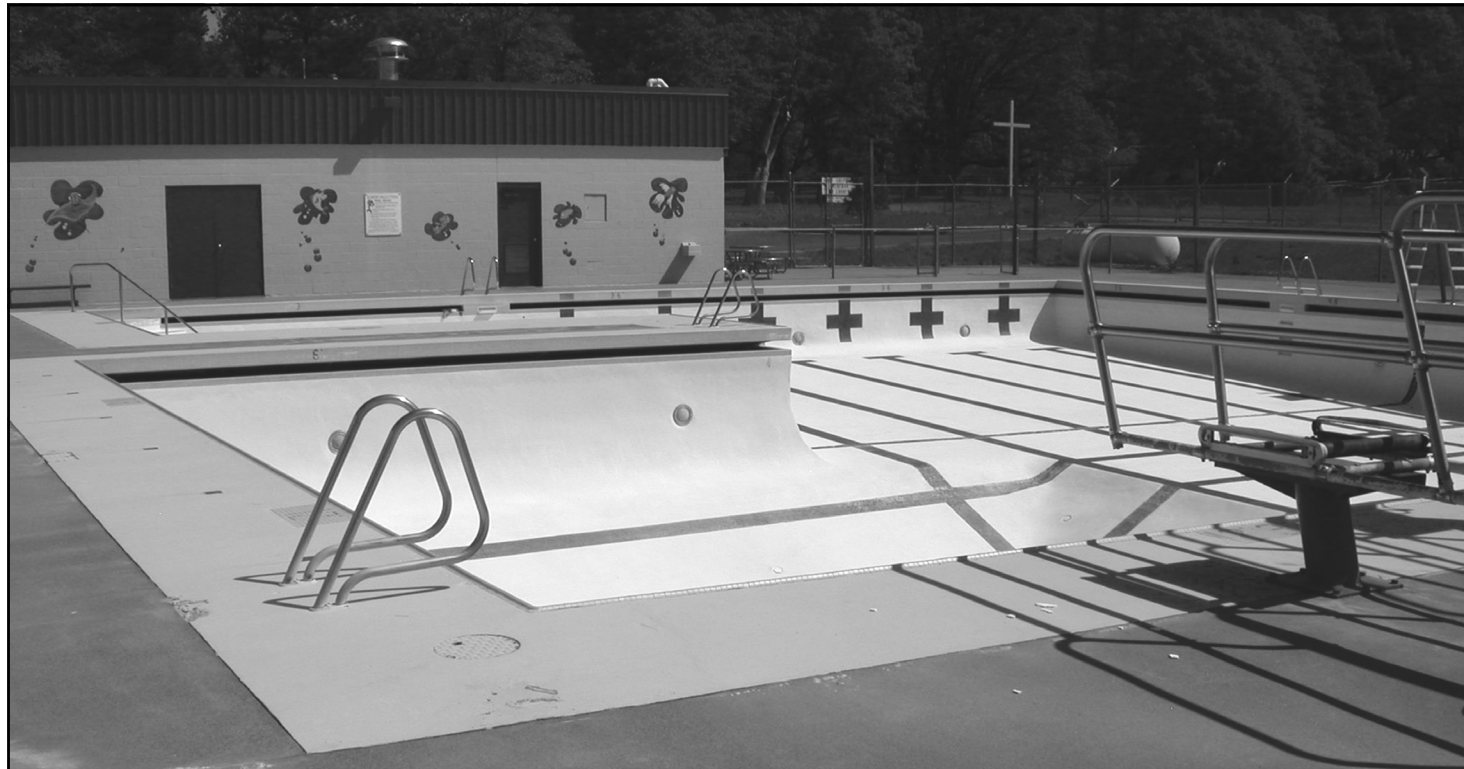
CITY POOLING ITS RESOURCES - The city of Cave Junction has drained the swimming pool on E. River Street as part of maintenance preparations for this