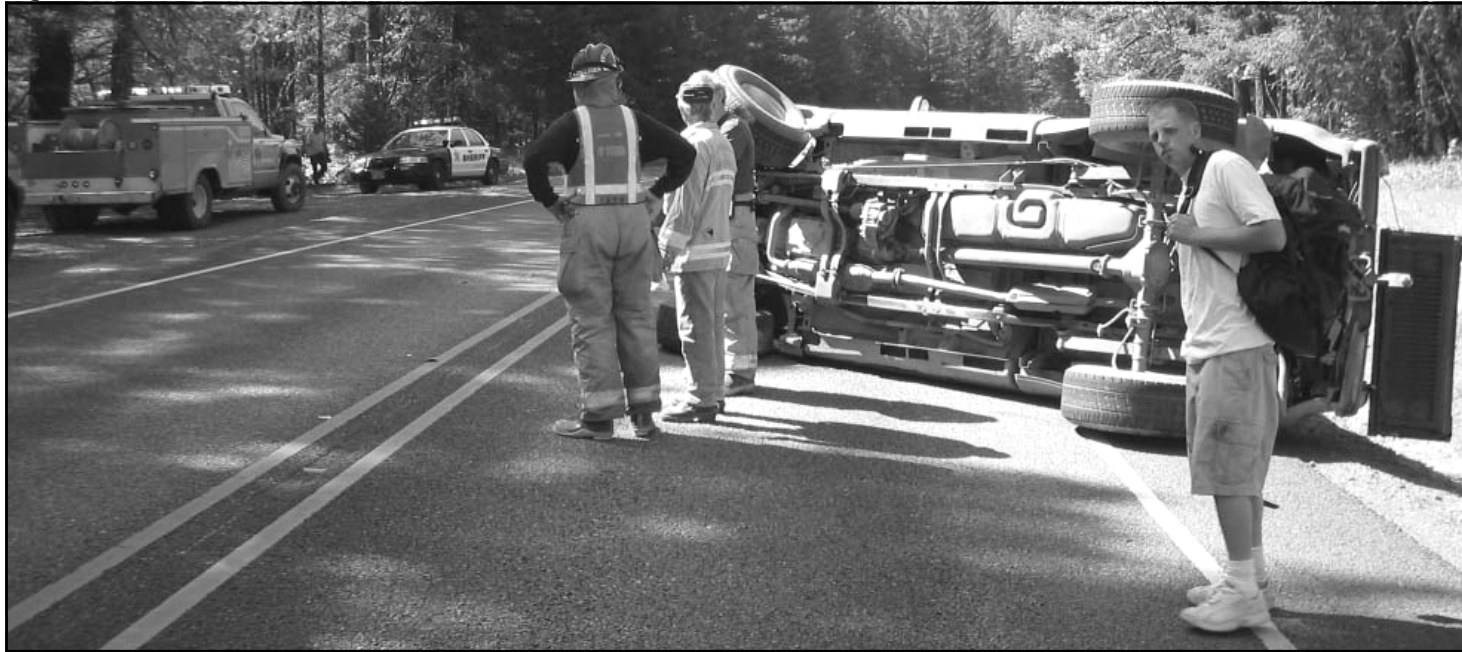
ROLLOVER AT SIS'S GAP - Illinois Valley emergency personnel responded to a report of a rollover accident on Hwy. 199 at Sis's Gap in Gold Canyon on Tuesday, April 27. The driver (above right) told an Oregon State Police trooper that something in the front end of his pickup truck locked, causing the vehicle to veer into the lane for southbound traffic, strike an embankment

and roll onto the passenger side. The driver declined to provide his name to a reporter, and other information was unavailable for this issue. Besides OSP, responders were American Medical Response, I.V. Fire District and Josephine County Sheriff's Office. The driver apparently was uninjured, and was not transported for medical attention.