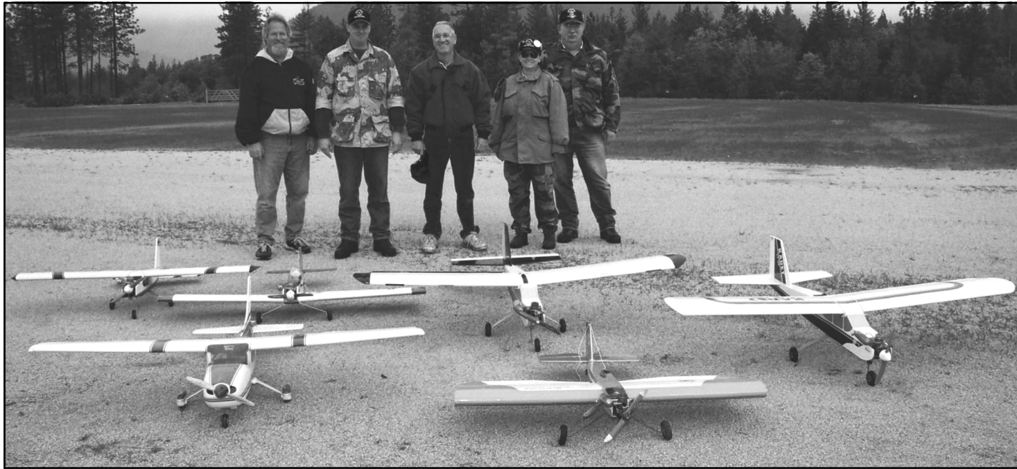
MODEL AIRPLANE SQUADRON - Members of Rogue Valley Flyers were at the Sky Park off Kerby Mainline Road recently with their radio-controlled model air-

craft. The group plans a number of other public events this year for Illinois Valley. Watch 'Illinois Valley News' for announcements about these special activities.