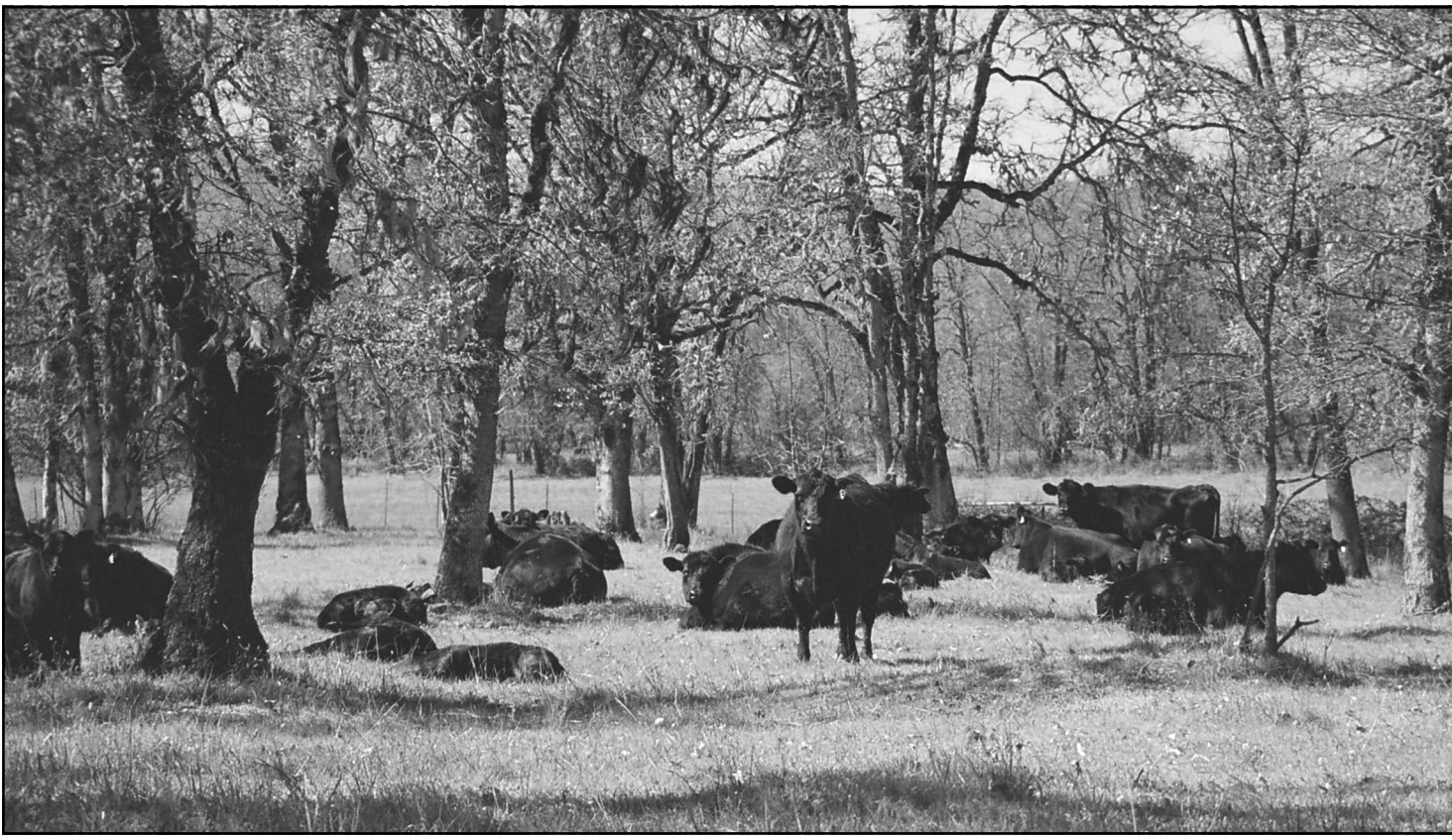
HOME ON THE RANGE - Illinois Valley is a locale where rural atmosphere is still evident, including sights -- and aromas. This view is on Dick George Road, and the photographer was thoroughly cowed.

The suspect told officers he planned to turn himself in on Monday, April 26.