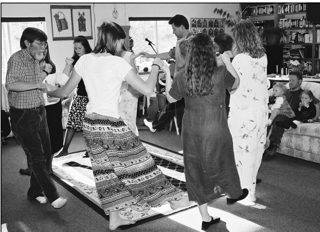
PASSOVER SERVICE - Some 80 people attended a Passover service on Monday night, April 5 at a gathering of Beit Emmanuel, an I.V. Messianic congregation. The service included blowing shofars (top) to call participants to worship; and worship dancing from the Hebrew tradition. There also was a potluck meal.