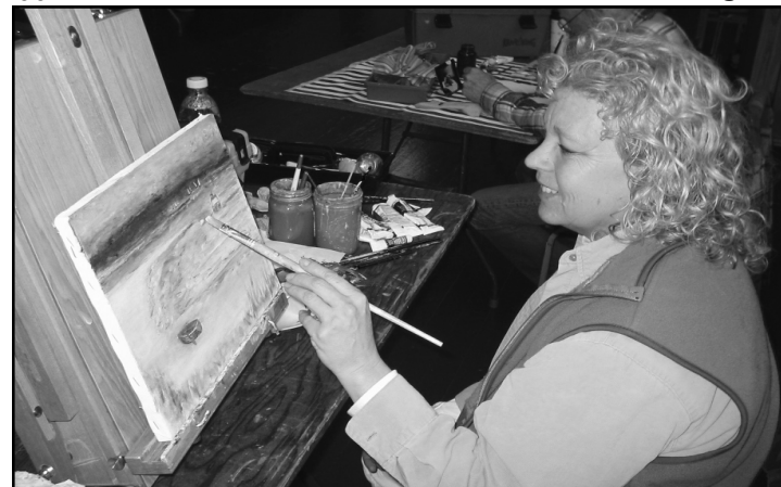
Valley artists at work at the RCC Belt Bldg. in Kerby