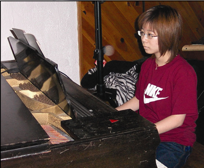
VALLEY TALENT ABUNDING - Musical and comedic talents of many types were displayed during a fund-raiser at Taylor's Sausage Country Store in Cave Junction on Saturday night, Jan. 24. The event, to benefit the Illinois Valley High School drug-and-alcohol-free graduation night party, was co-sponsored by Taylor's and Home Valley Bank. A large, enthusiastic crowd attended the benefit.