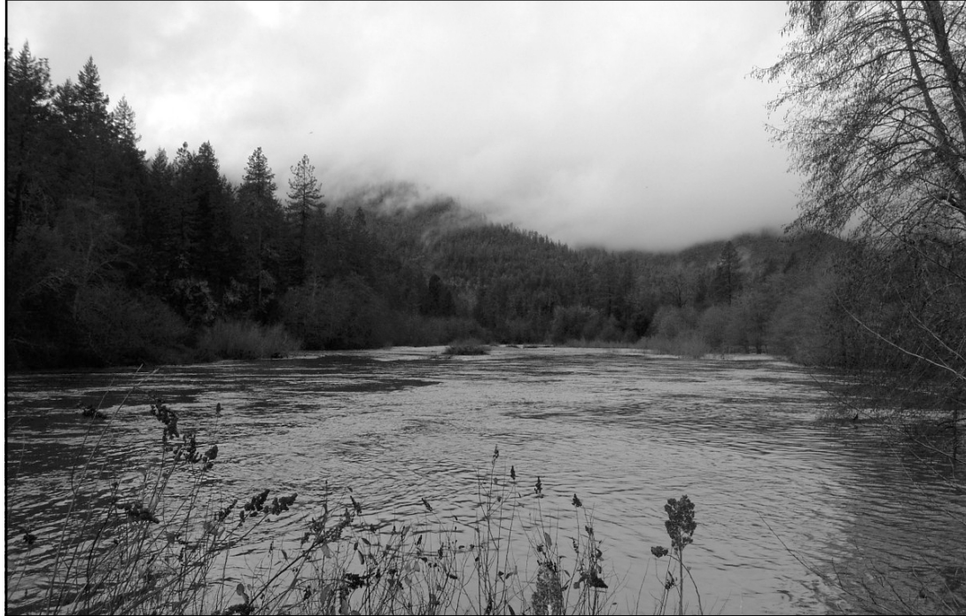
A RIVER RUNS THROUGH - Swollen with the recent rainfall, the Illinois River flows mightily at the Illinois River 'Forks' State Park south of Cave Junction. For anyone interested, peace and solitude abound during the winter months when the occasional sunny day brings a welcome respite from the cold and wet.