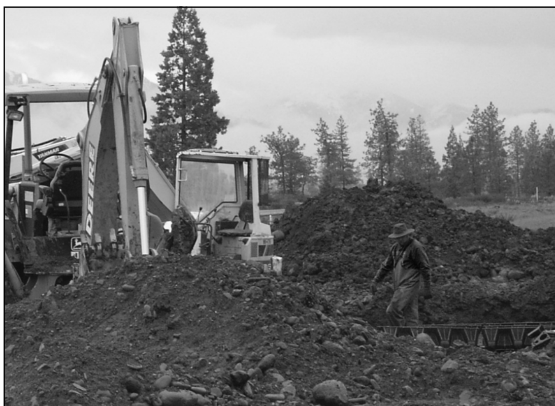
AIRPORT BUILDING GROUNDWORK - Work is continuing on a business incubator project under Illinois Valley Community Response Team. Funding consists of $500,000 from the USDA's Rural Utility Service and approximately $200,000 from Josephine County. The project is to provide a central location for new or existing businesses to utilize common services. Current work is being handled by TJ Bossard Consulting Engineers, Copeland Sand & Gravel, and Ed's Backhoe.