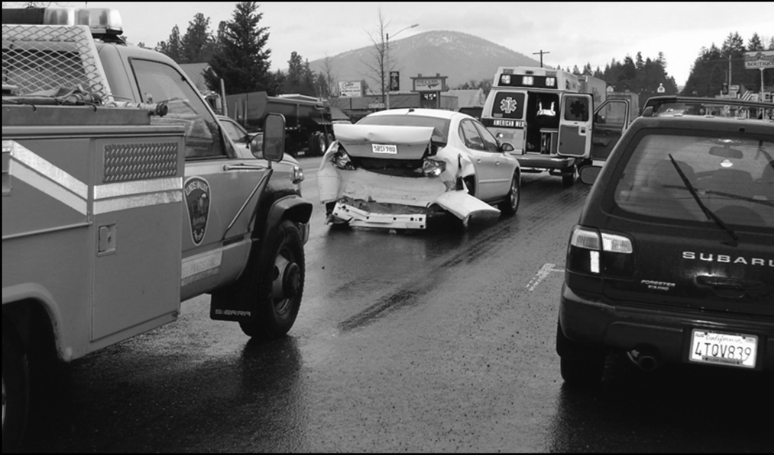
DOWNTOWN CJ COLLISION - Two vehicles were involved in an accident at 12:19 p.m. on Friday, Jan. 9 at Redwood Hwy. and W. Lister Street. Emergency responders were American Medical Response, Illinois Valley Fire District and Josephine County Sheriff's Office. No injuries were reported.

*4:54 p.m., medical aid 1600 block Crooks Creek Road.