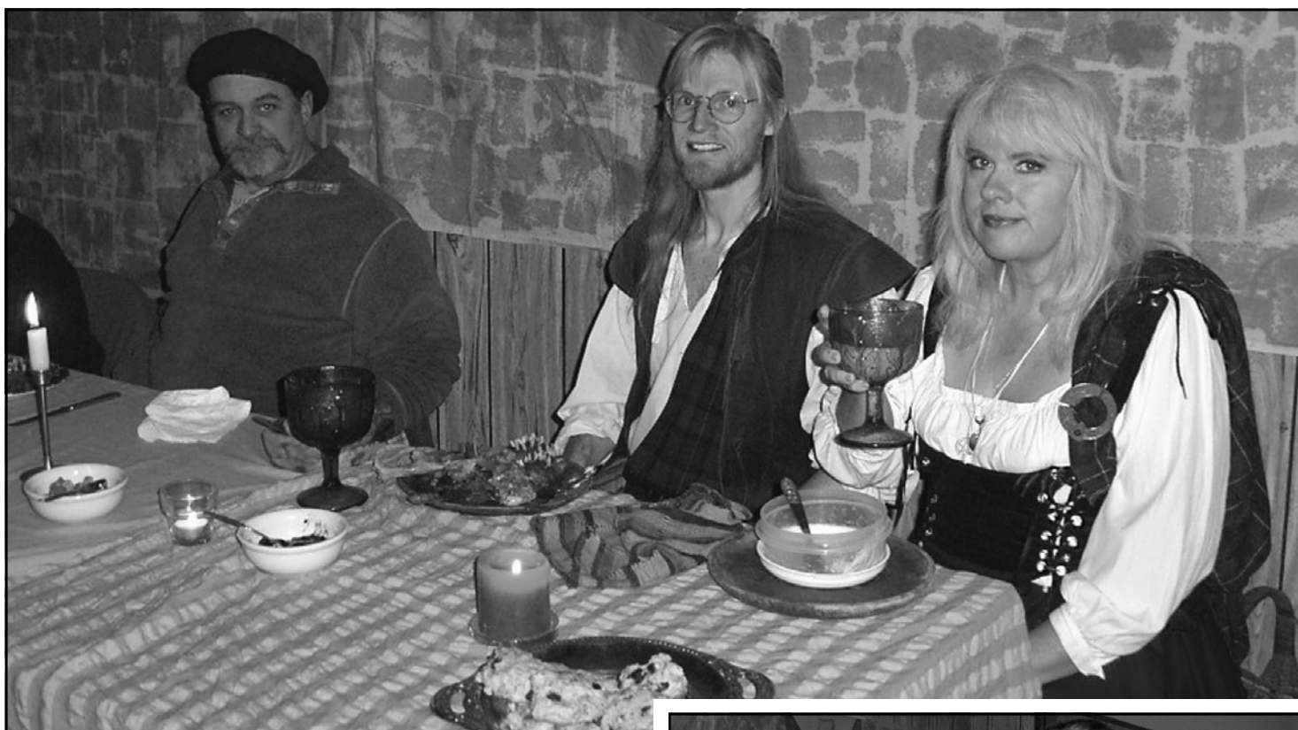
SCOTTISH NEW YEAR - A Scottish New Year feast was held on Saturday, Jan. 3 at the RCC Belt Bldg. in Kerby. The event was sponsored by the Shire of Myrtleholts/Caversgate of the Society for Creative Anachronism. Participants were served traditional Celtic food. The evening also included entertainment, and some of those attending wore Renaissance attire.

For more information on the Ombudsman Program, call (800) 522-2602.