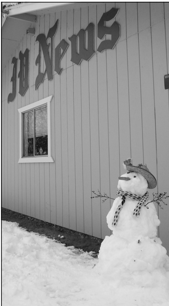
SNOWY SENTINEL - Brave 'I.V. News' customers who wandered out into the snow and ice were greeted by 'Scoop' the snowman who mysteriously made an appearance during the New Year's snowstorm.

Other industry-based and workplace skills classes will be phased in, plus, general education classes such as math and English, as well as basic skills classes.