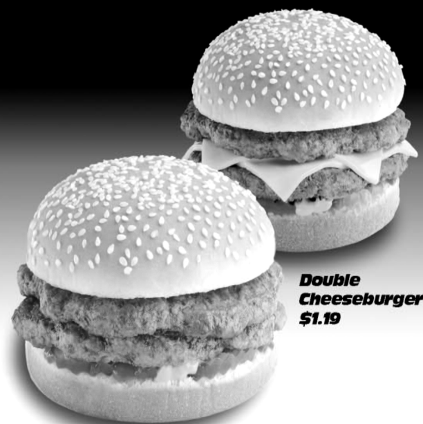
Double Cheeseburger $1.19

Eat up. You'll need energy to tackle dessert.