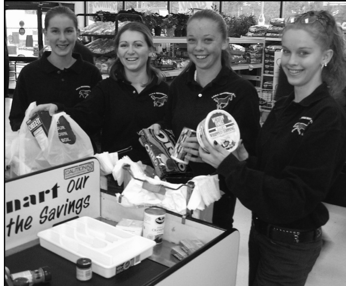
HELPFUL HANDS - With smiles on their faces, members of the Illinois Valley High School equestrian team assist shoppers at Shop Smart Food Warehouse on Tuesday, Nov. 25 by bagging their groceries. The tips the students earned on the job will go to the team.

The Illinois Valley Chamber of Commerce is hoping for dry weather to kick off a peaceful holiday season with the I.V. Holiday Parade on Saturday, Dec. 6 at 3 p.m.