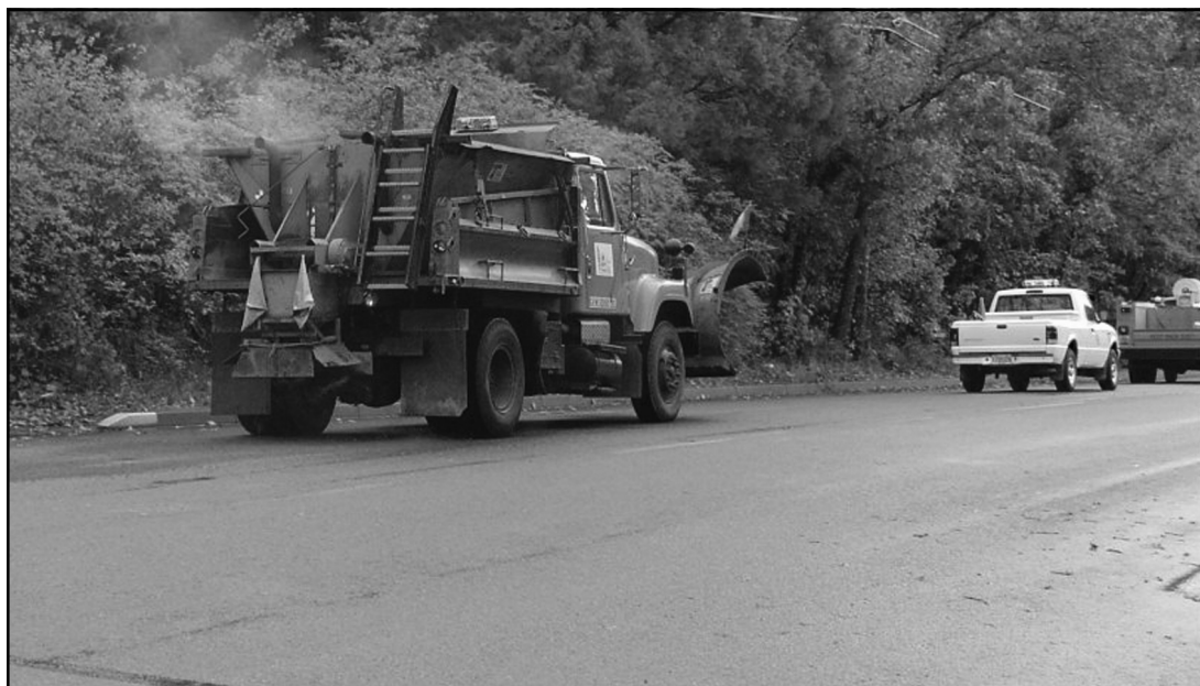
SLIPPERY WHEN WET - Cave Junction city road crews spread sand over a diesel fuel spill on East River Street between Old Stage Road and Redwood Hwy. on Monday morning, Nov. 10. There were no accidents as a result of the spill, but drivers reported slipping on the fuel, according to Joe Feldhaus, of the Illinois Valley Fire District.

*Meatloaf with gravy, whipped potatoes with gravy, Scandinavian blend vegetables, potato wheat roll, birthday cake