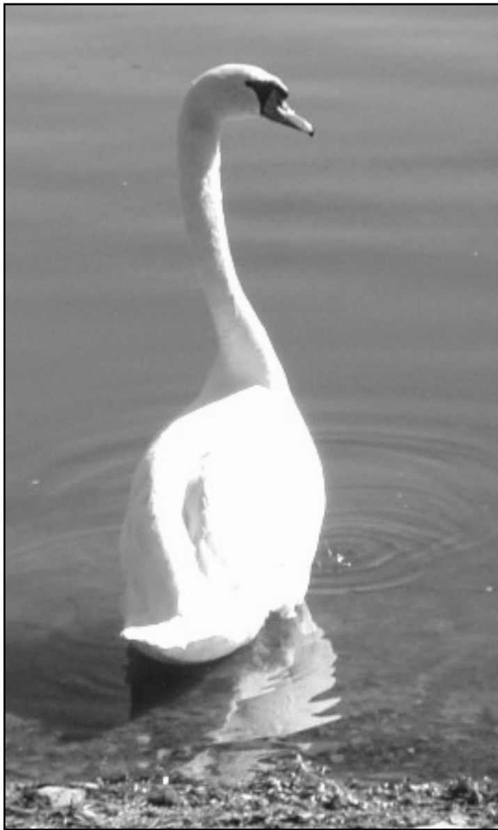
SWAN REFLECTIONS -- A lone swan enjoys an autumn afternoon at Lake Selmac. Warm autumn evenings are expected to give way to colder temperatures starting on Wednesday, Oct. 29.