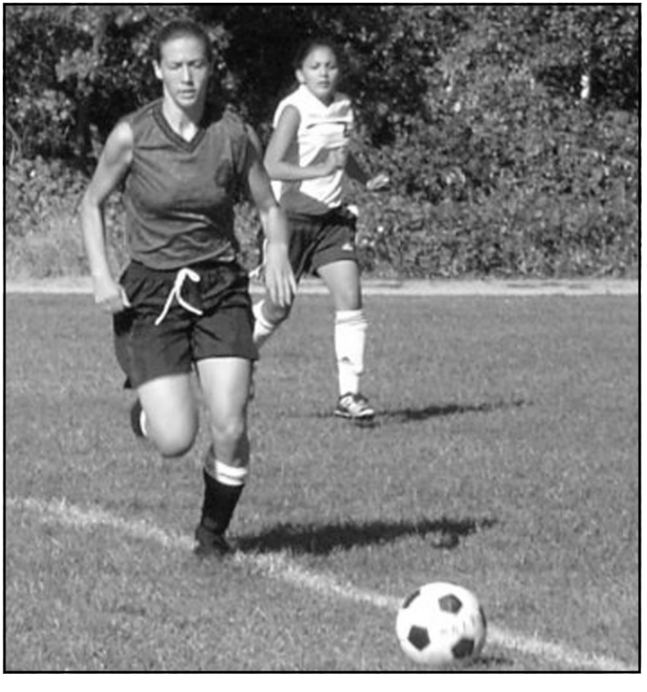
TOUGH GAME -- The Lady Cougars had their hands full with North Valley Saturday, Sept. 27 in an 11-1 loss.