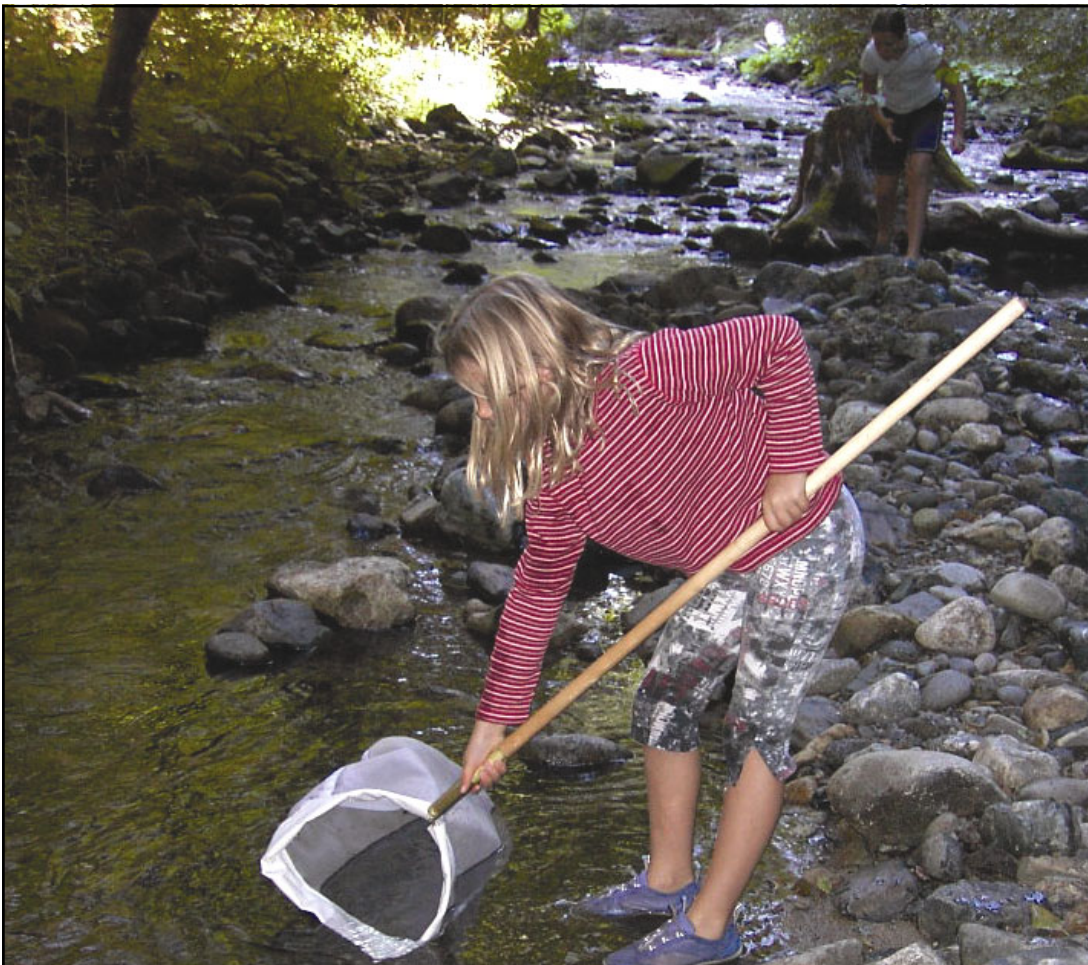
'KIDS & BUGS' - A group of youngsters participated on Saturday, Sept. 20 in a 'Kids and Bugs' program at Chinquapin Campground on Grayback Creek out Caves Hwy. The event taught how to collect and identify aquatic insects and their value in relation to the life cycle of salmon, and water quality. Co-sponsors were the Rogue Basin Coordinating Council and Illinois Valley Watershed Council. (Another photo, page 8)