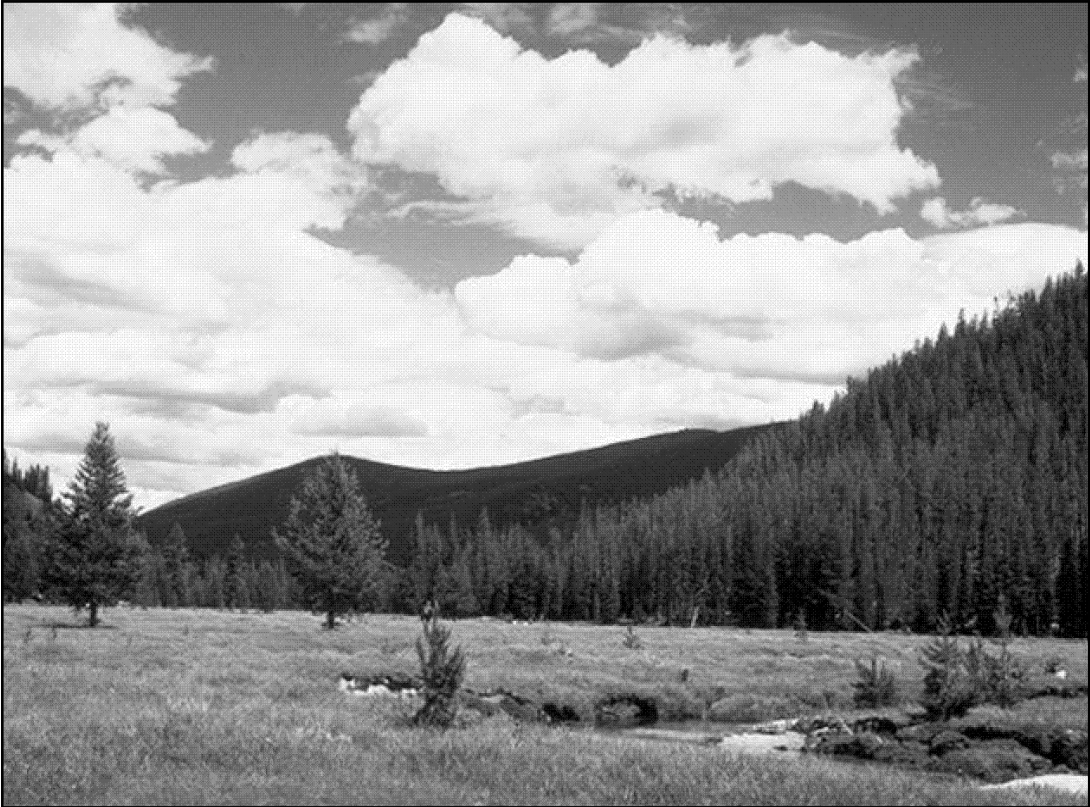
A pleasant summer afternoon in Illinois Valley

fire, 33000 block Redwood Hwy. *9:08 p.m., smoke investigation, 1000 block Idlewild. Friday, August 15 *5:45 p.m. ADT Fire Alarm, 400 block Addison Lane Saturday, August 16 *8:37 a.m., medical assist, 9200 block Holland Loop Road. *2:13 p.m., medical assist, 9200 block Holland Loop Road. *6:42 p.m., smoke investigation, 24000 block Redwood Hwy. Sunday, August 17 *11:06 p.m., medical assist, 8700 block Takilma Road. Monday, August 18 *3:27 a.m., medical assist, 5800 block Holland Loop Road. *3:27 a.m., medical standby, 681 Caves Hwy. *3:31 a.m., medical assist, 300 block Burch Drive. *3:31 a.m., medical standby, 681 Caves Hwy. *3:41 a.m., medical assist, 2100 block White Schoolhouse Road.