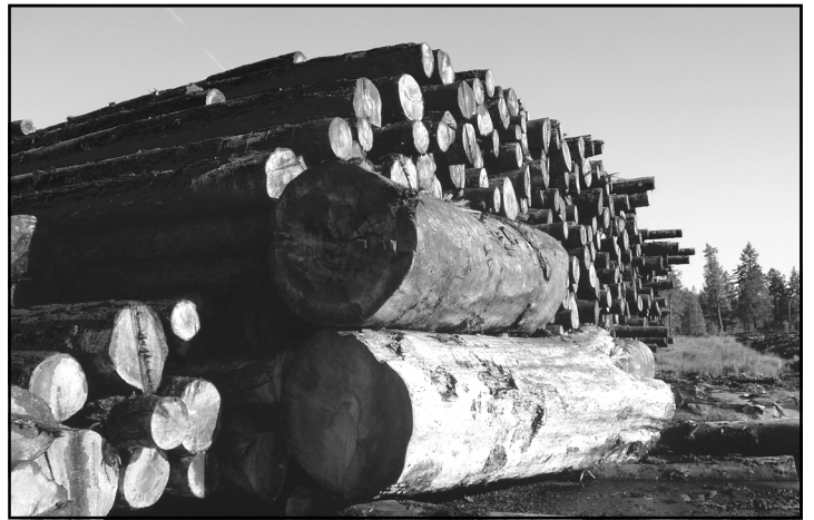
DECKED OUT - Logs waiting to be milled at Rough & Ready Lumber Co. show that even though the mill has been scaled back in production and employees, workers are still hard at work. Since the mill reopened in June, it is one of the few mills that is capable of handling large diameter timber.