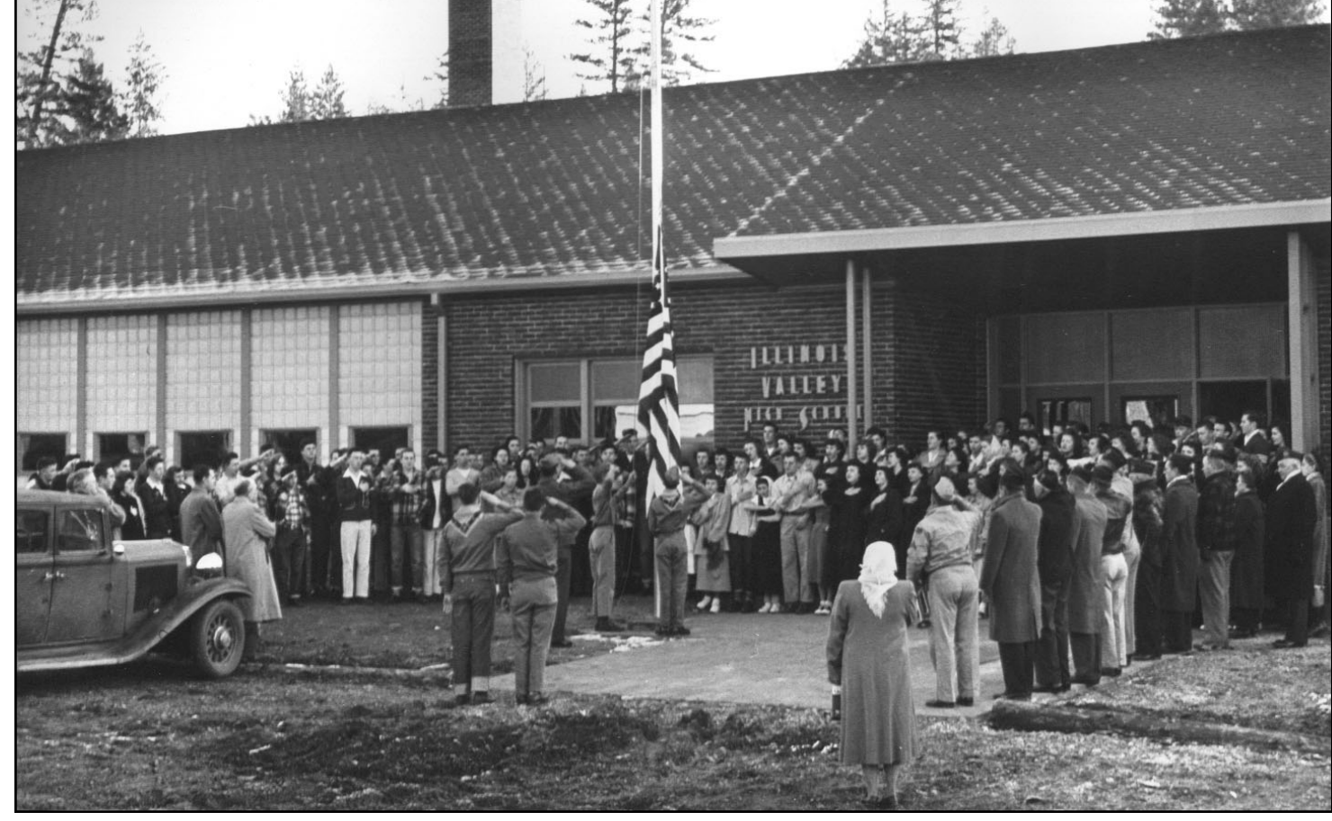
THEN AND NOW - It was Feb. 1, 1950 (top) when the current Lorna Byrne Middle School was dedicated as Illinois Valley High School. Much of the original middle school, in use since 1978, has been destroyed to make room for new construction (bottom). The project is funded through voter-approved bonds for Three Rivers School District. The new and improved middle school is to be ready in time for classes on Sept. 2, the day following the I.V. Lions Club three-day Labor Day Festival.