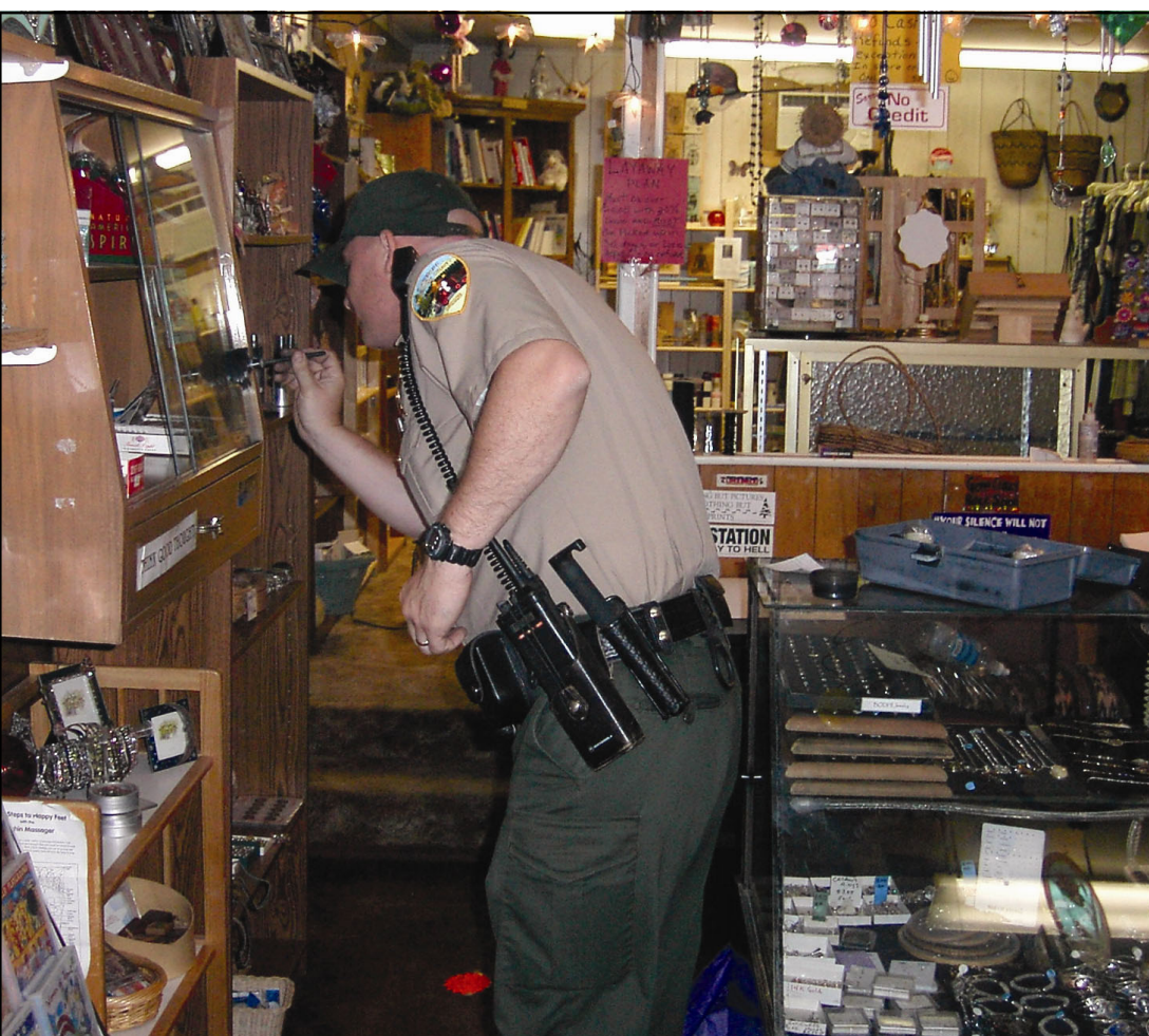
A sheriff's deputy dusted for fingerprints in Bear Images after a burglary.

Members of the I.V. Fire District spent five hours mopping up the blaze. Four firefighters, a water tender and a brush truck left the scene to help fight a fire in Grants Pass on Robertson Road.