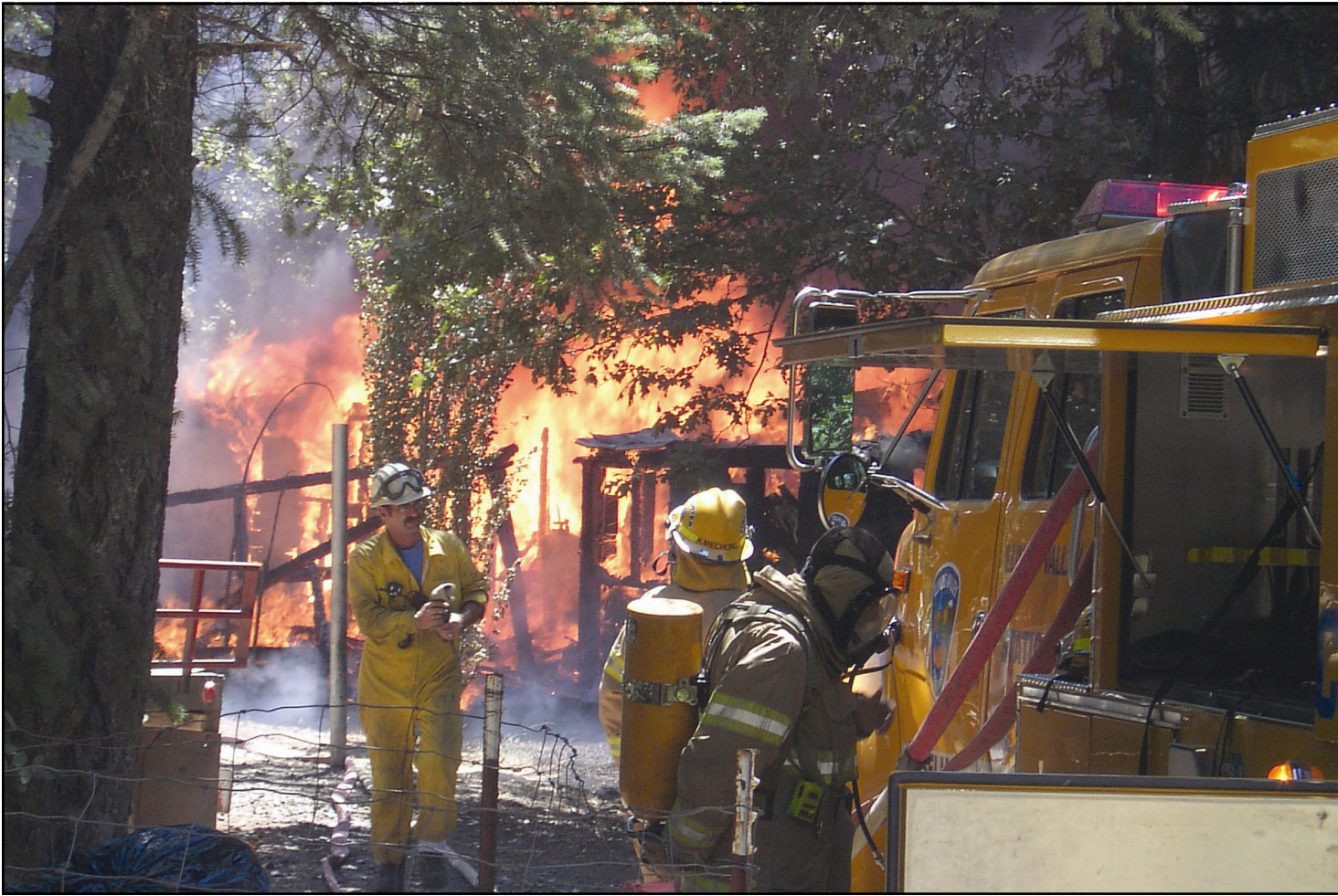
No injuries were reported in a Selma mobile home fire fought by I.V. firefighters.

Cave Junction citizen patrol meeting Friday, Aug. 8 at 7p.m. Jubilee Park Pavilion