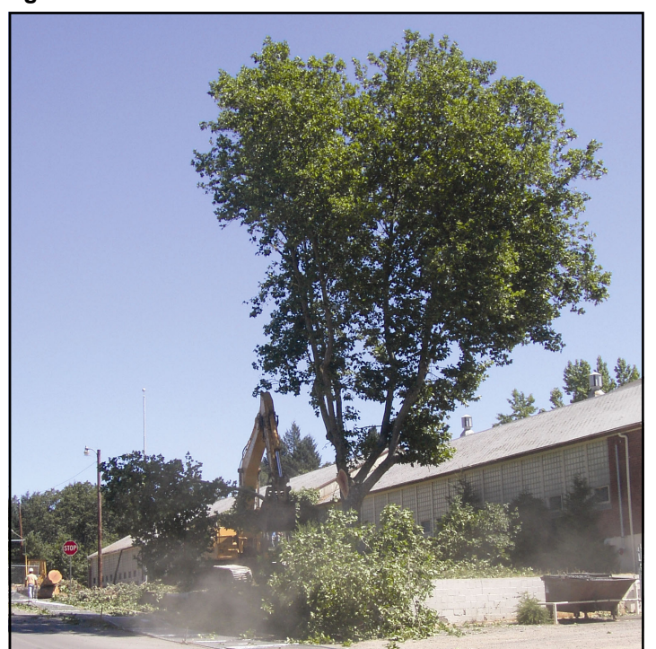
LAST GIANT - The final tree in front of Lorna Byrne Middle School fell on Monday, July 14. The six trees that lined North Junction Ave. were removed as part of the construction of the new school's parking lot. Demolition of the former wood shop building has begun at the north end of the school.