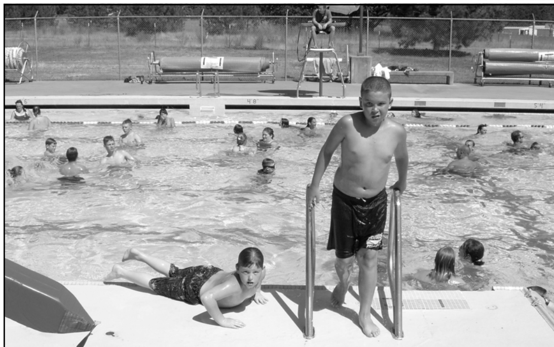
FLOATING FOR FREE - The Cave Junction Pool held its grand opening on Saturday, June 28. Dozens of swimmers young and old hit the water to cool down on the hot afternoon which reached around 100 degrees. Besides free swimming for all, the celebration included free Taylor's hot dogs and drinks. Stop by the pool to pick up this season's schedule.

Everyone then retired to the social hall for fellowship and the refreshment, for which Western Star is noted.