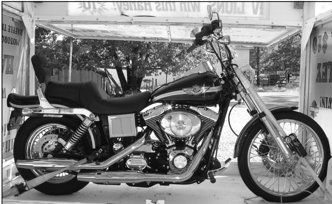
WIN THIS MOTORCYCLE - The 2003 Harley Davidson FXDWG Dyna Wide Glide pictured above will be raffled off on Sept. 1 at 6 p.m. during the I.V. Lions Club Labor Day celebration at Jubilee Park. Raffle tickets are $10 each and are being sold throughout the valley, Southern Oregon and Northern California. The motorcycle is valued at $18,300. Proceeds raised through the raffle will go toward various club philanthropic efforts. Winner need not be present to win.