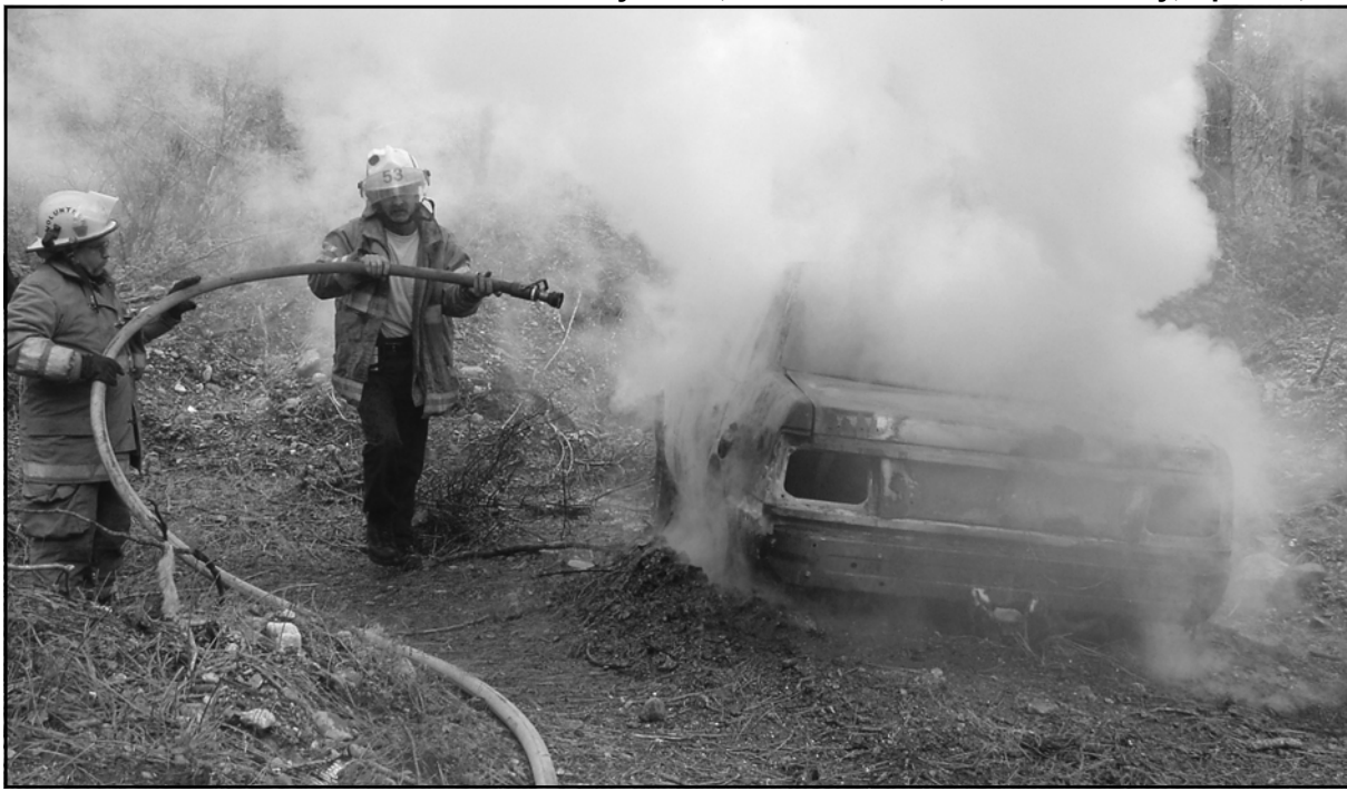
WESTSIDE CAR FIRE - Firefighters from Illinois Valley Fire District responded to a car fully involved in flames on Friday, April 11 at approximately 4 p.m. The vehicle was in a wooded area at milepost 5 of Westside Road. Indications are that the car, a Mazda without license plates or vehicle identification number, might have been stolen. The fire apparently began in the passenger seat, said Maintenance Division Chief Joe Feldhaus. Several fish skeletons littered the ground near the car, leading to speculation that squatters might have been involved.

*11:22 a.m. Medical assist: 400 block S. Junction Avenue. *6:02 p.m. Medical assist: 8600 block Takilma Road. *8:05 p.m. Medical assist: 500 block Schumacher Avenue.