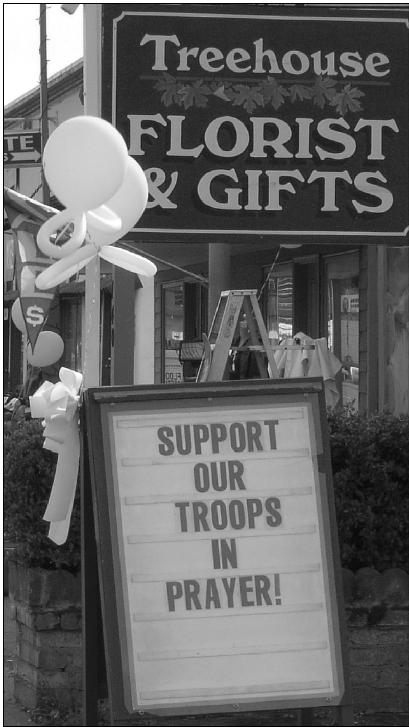
WAR SUGGESTION - Stating the sentiments of many in Illinois Valley, Treehouse Florist & Gifts in Downtown Cave Junction suggests that no matter how one feels about war, a person can always pray.