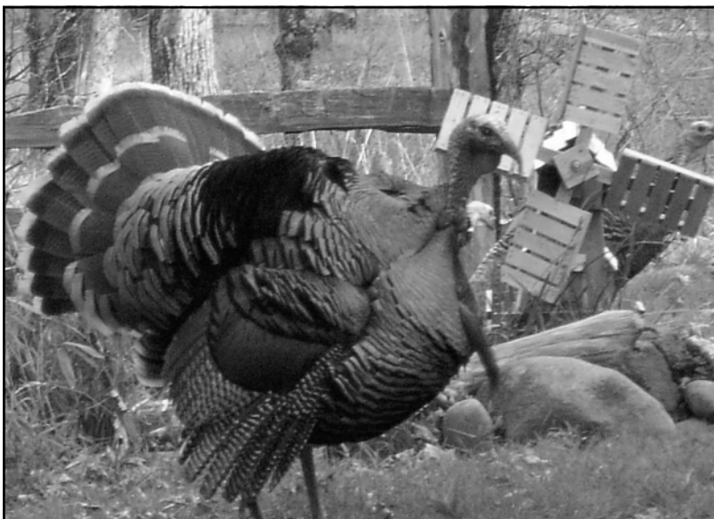
TURKEY LURKEY - This tom turkey, (fondly referred to as 'Godzilla') along with his harem, returns every year about this time to the same area in the valley. He has the homeowners totally intimidated, along with their dog.

Government employment fell by 10 over the month and was little changed over the past year, it was reported by OED.