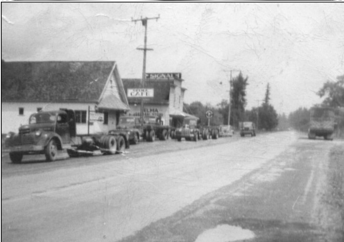
BEAUTIFUL DOWNTOWN SELMA - In a blink of an eye, downtown Selma could disappear in 1948, but it did offer some services. The Selma Café, operated by Thelma and Harold Lundquist, and stood approximately where the Texaco diesel pumps are now, offered weary travelers a bite to eat as they gassed up at Ivan Burr's Signal Gas Station/Selma General Store next door.