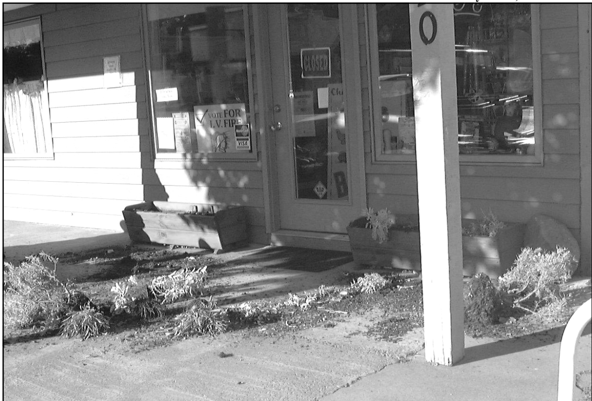
VANDAL INFORMATION SOUGHT -- Josephine County Sheriff's Office is looking for vandals, who ripped out newly planted flowers, shrubs and a small tree from in front of Child's Play in Downtown Cave Junction early Friday, Oct. 11. The mess was cleaned up and the plants replanted in time for the Art Walk. The vandalism has left business owners shaking their heads in dismay. Information about the vandals should be given to the sheriff's office.